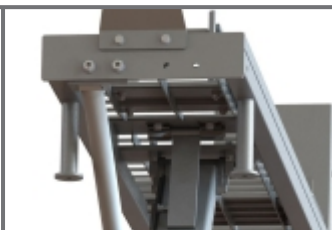
MECHANICAL LOCKING SYSTEM