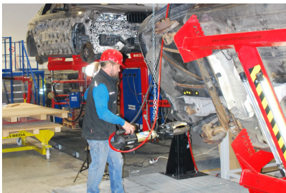
Easy access to the car bottom